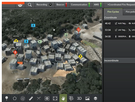
Fire Management Terminal